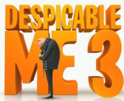
(Rated G, General)

REMINDER: Anytime you visit Boston Pizza Orleans, TESC can accumulate a percentage of all sales? Just write Trillium Elementary on the back of your receipt and place it in the box at the hostess desk